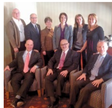
Meeting with the assistant deputy ministers of the Office of Francophone Affairs and the Ministry of Children and Youth Services, Toronto, March 2015

60 participants, including more than 10 provincial decision-makers and influencers, attended the third annual Ontario Francophone Health Forum presented by the Alliance des Réseaux ontariens de santé en français and the Regroupement des Entités de planification des services de santé en français de l'Ontario.