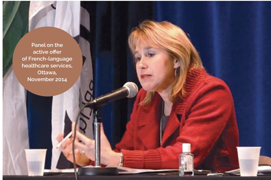
Panel on the active offer of French-language healthcare services, Ottawa, November 2014

Provincial and national coordination helps to pave the way toward greater healthcare system accountability regarding French-language health services. Front and centre are the issues of data and active offer of French-language services.