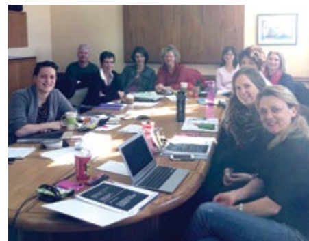
National videoconference on mental health, Kingston, February 2015