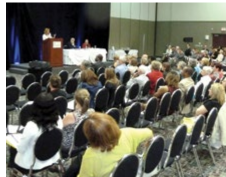
Annual General Meeting 2014 – 15 th Anniversary, Ottawa, May 2014