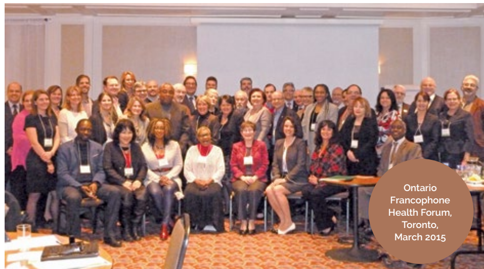
Ontario Francophone Health Forum, Toronto, March 2015

5 broad objectives are set out in the 2014-2015 Joint Annual Action Plan to guide the collaboration between the Réseau, the Champlain LHIN and the South East LHIN: