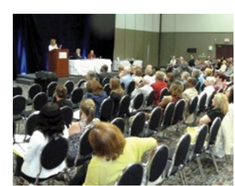
Annual General Meeting 2014 – 15<sup>th</sup> Anniversary, Ottawa, May 2014